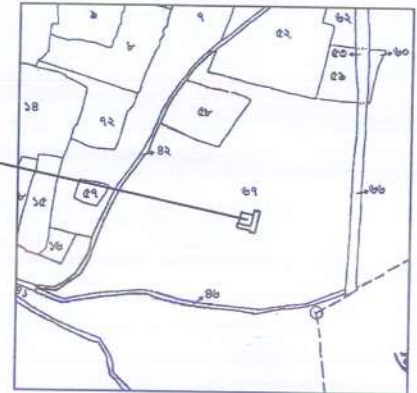
INDEX MAP (SCALE :- 1"=330')

R.S. PLOT NO.- 43/67(P) L.R. PLOT NO.- 194 LAND AREA- 9 DEC.